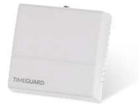
TRT032N with tamper proof cover fitted