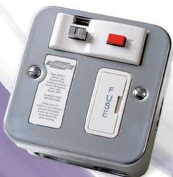
RCD16ML Passive GREY BUTTON

Shares all the features and benefits of the RCD05WAV but remains latched when the power supply is temporarily lost.