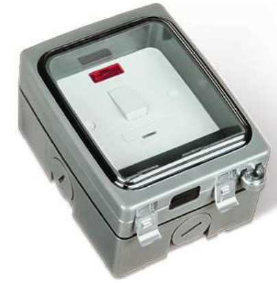
WEATHERSAFE IP66 RATING TGV103N