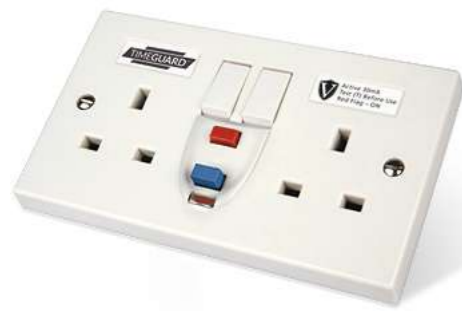
Active BLUE BUTTON RCD05WAV