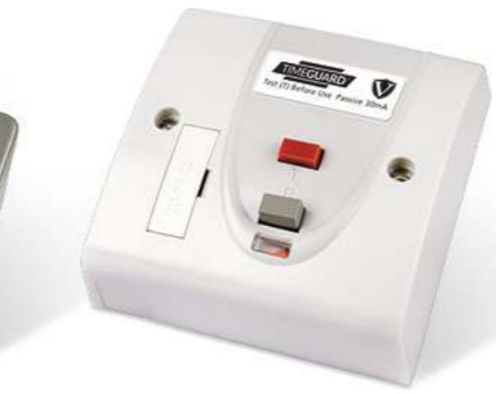
Passive GREY BUTTON RCD10WPV