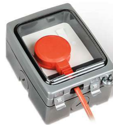
WEATHERSAFE IP66 RATING TGV101N