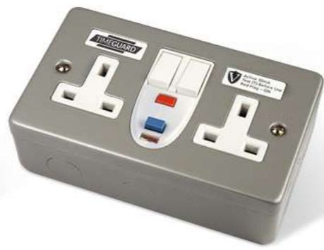
Active BLUE BUTTON RCD07MAV