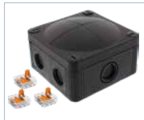
COMBI 407/WW (Black)

Protection Class IP66/67 Material Polypropylene, Gasket: TPE Dimensions 95 x 95 x 60mm Glow wire test 750 °C Temperature range -30 °C - 100 °C Advice 7 x 20mm threaded entries / 1 x 25mm knockout