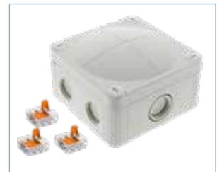
COMBI 407/WW (Light Grey)